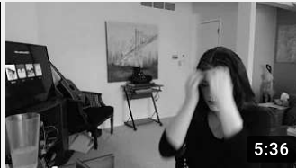
Monroe County NY Trafficking Family Court...