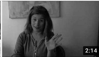
May 1, 2020 prior to family court date that I was not...