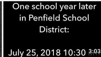
One school year later in Penfield School District: July 25, 2018 10:30