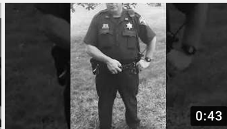
Actual audio of recorded 4th Amendment Violation that...