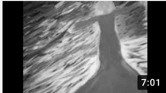
Happy Holidays Monroe County, New York