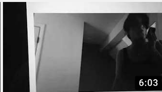
Scam Likely warning NY taxpayers & parents Bullshit...