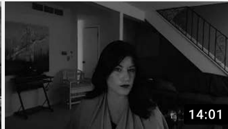
December 2020, the way it is...